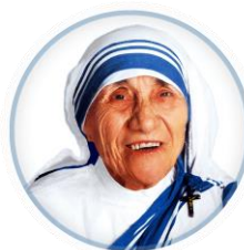
St Teresa of Kolkata Mother Teresa

We ask these prayers and all the prayers of our hearts through Christ our Lord. Amen.